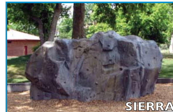
SIERRA 20'L x 8'W x 9'H; 2600 lbs; 100 Handholds USE ZONE 6' FALL HEIGHT 9'

To verify product certification visit www.ipema.org