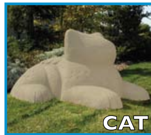
CAT 46"W x 68"L x 33"H 130 lbs