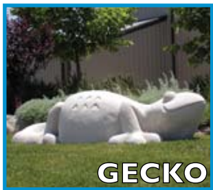
GECKO 42"W x 96"L x 24"H 180 lbs