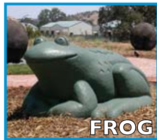
FROG 42"W x 54"L x 25"H 135 lbs