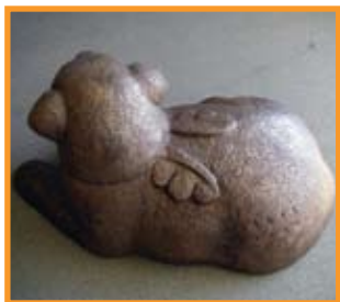
Cold-Cast Bronze Special order only, call for quote