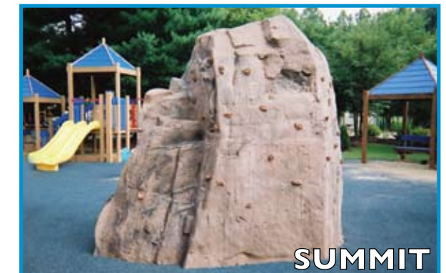
SUMMIT 9'L x 8'W x 9'H; 1400 lbs; 50 Handholds USE ZONE 6' FALL HEIGHT 9'