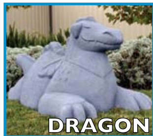
DRAGON 38"W x 89"L x 33"H 175 lbs