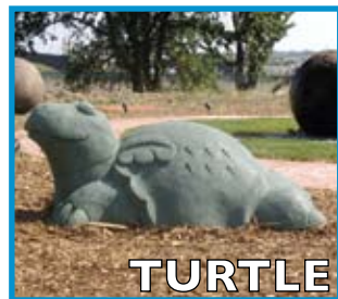
TURTLE 38"W x 62"L x 27"H 145 lbs