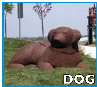
DOG 46"W x 45"L x 26"H 115 lbs