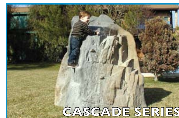
CASCADE SERIES Cascade #I: 8'L x 6'W x 7'H; 750 lbs; 30 Handholds USE ZONE 6' FALL HEIGHT 7' Cascade #II: 7'L x 5'W x 6'H; 550 lbs; 20 Handholds USE ZONE 6' FALL HEIGHT 6' Cascade #III: 5'L x 5'W x 5'H; 300 lbs; 15 Handholds USE ZONE 6' FALL HEIGHT 5'