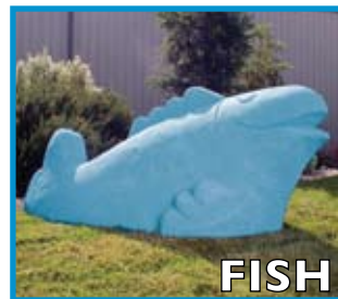
FISH 38"W x 84"L x 33"H 150 lbs